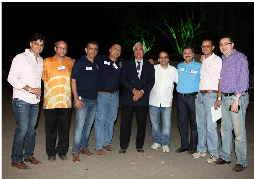
Baldy with some SMAA committee members at the kickoff for the 150 year celebrations